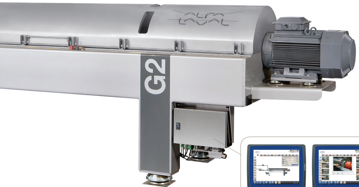
G2 with 2Touch® control system

Alfa Laval, the world leader in cutting edge decanter centrifuge technology, is committed to helping customers optimize their processes through reduced power consumption, increased performance, and continuous process optimization.